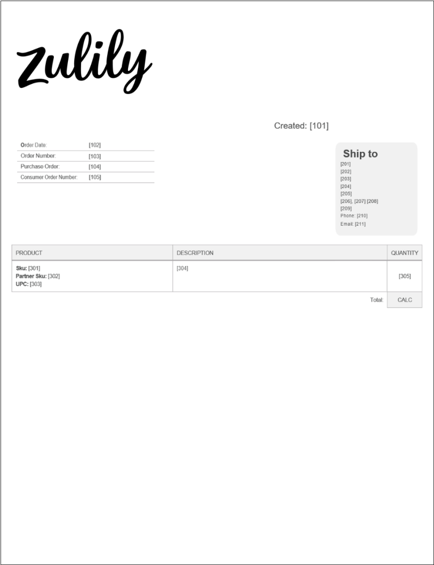
Figure 2 Sample Regular Packing Slip with Order Message References

The Zulily packing slip sample below includes bracketed numbers that correspond to data elements received from the order. The tables in this section map each bracketed number with its corresponding flat-file field name and EDI segment.