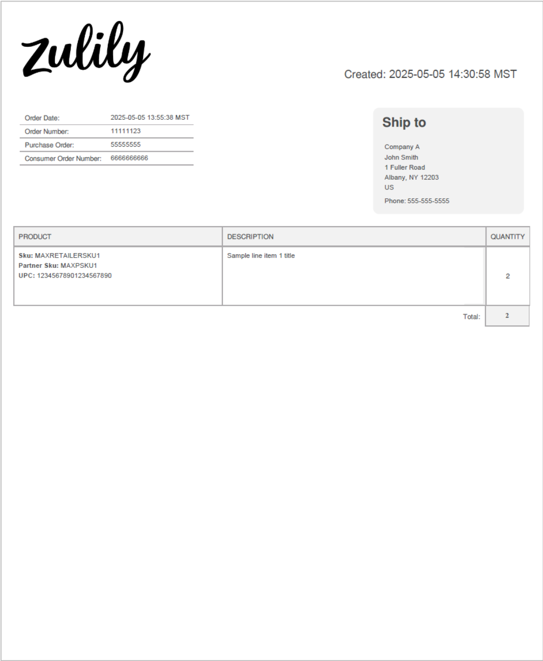
Figure 1 Sample Regular Packing Slip

Below is a sample of the Zulily packing slip.