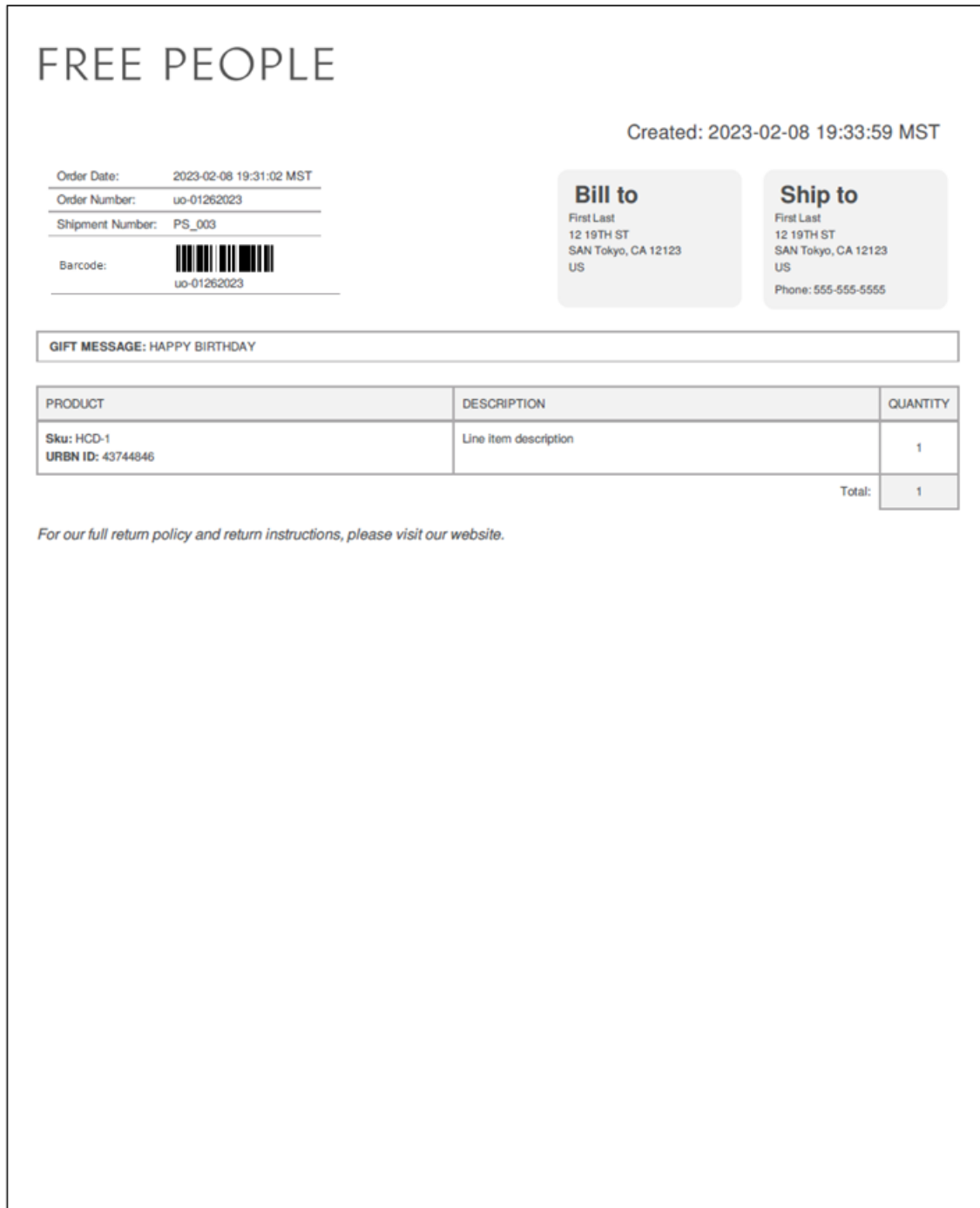
Figure 2 Sample Free People Regular Packing Slip

Below is a sample of the URBN packing slip for the Free People brand.