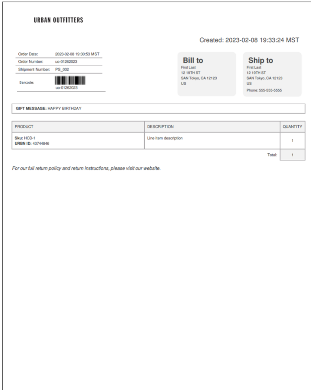
Figure 4 Sample Urban Outfitters Regular Packing Slip

Below is a sample of the URBN packing slip for the Urban Outfitters brand.