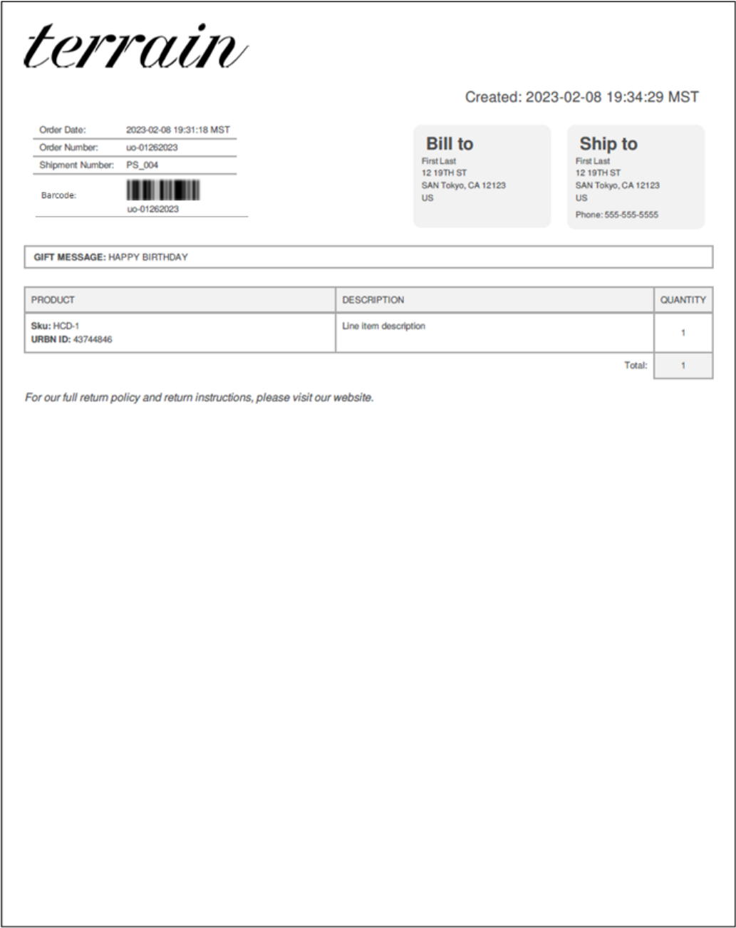
Figure 3 Sample Terrain Regular Packing Slip

Below is a sample of the URBN packing slip for the Terrain brand.