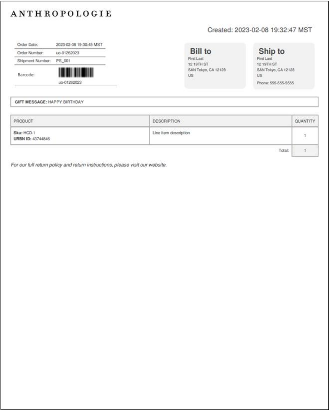
Figure 1 Sample Anthropologie Packing Slip

Below is a sample of the URBN packing slip.