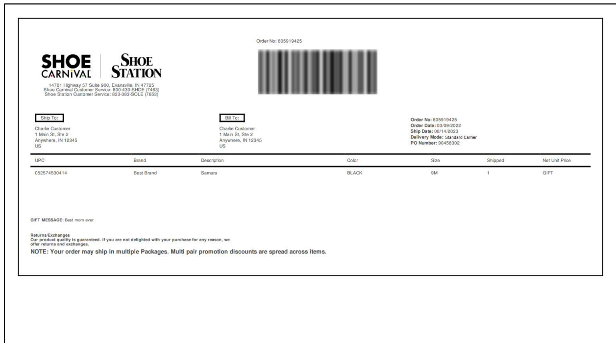
Figure 2 Sample Gift Packing Slip