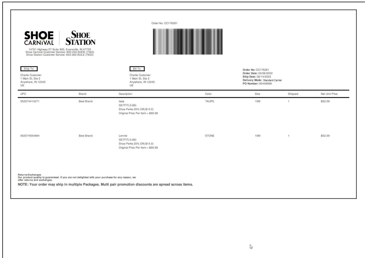
Figure 1 Sample Regular Packing Slip

Below is a sample of the Shoe Carnival packing slip.