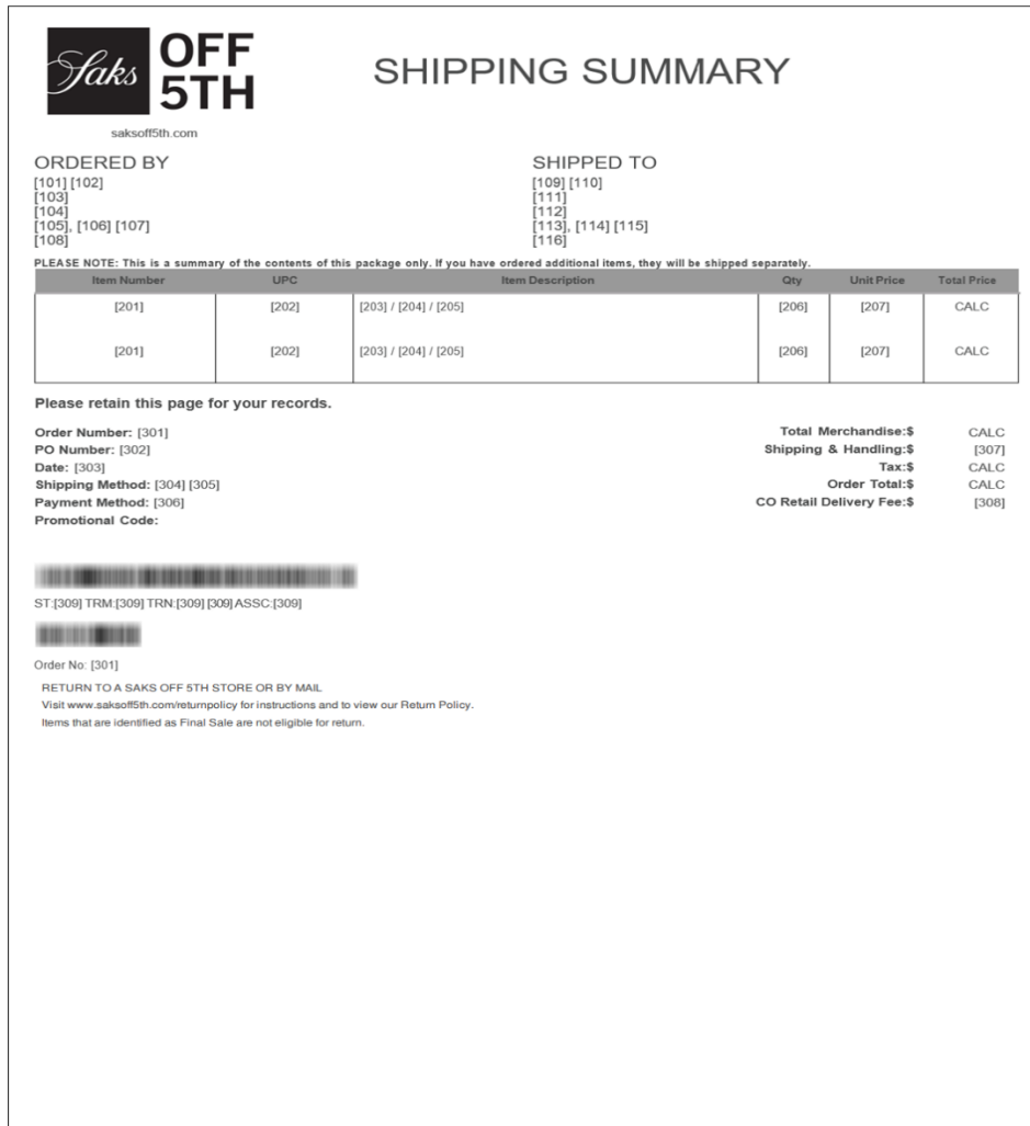
Figure 2 Sample Regular Packing Slip with Order Message References

The Saks OFF 5TH packing slip sample below includes bracketed numbers that correspond to data elements received from the order. The tables in this section map each bracketed number with its corresponding flat-file field name and EDI segment.