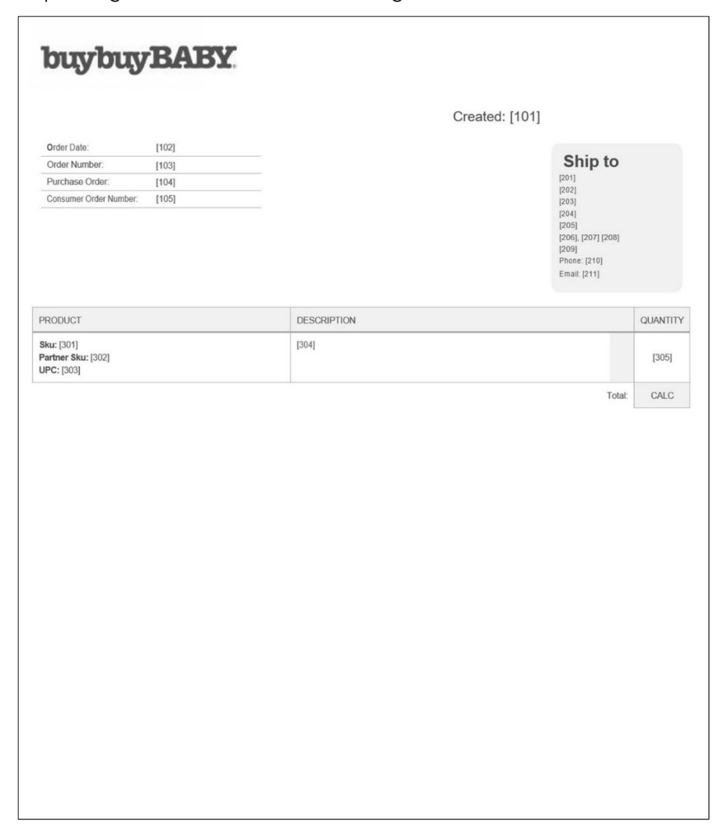
Figure 2 Sample Regular Packing Slip with Order Message References

The Buy Buy Baby packing slip sample below includes bracketed numbers that correspond to data elements received from the order. The tables in this section map each bracketed number with its corresponding flat-file field name and EDI segment.