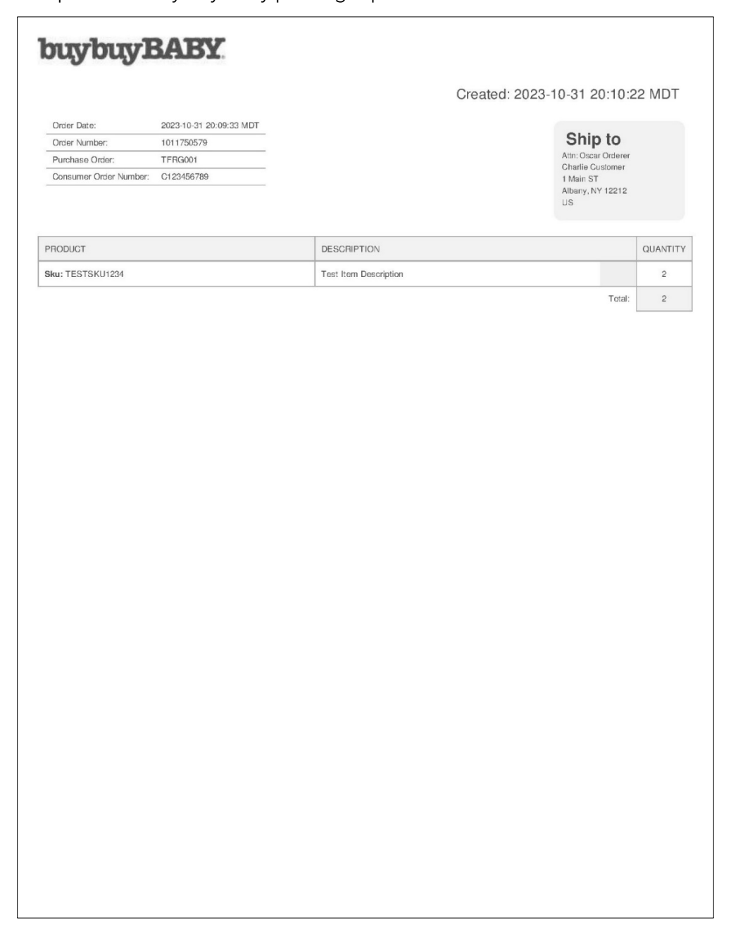
Figure 1 Sample Regular Packing Slip

Below is a sample of the Buy Buy Baby packing slip.